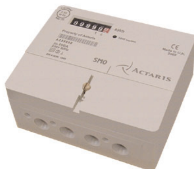
▶ SMO meter

The Actaris SMO is an extremely compact sealed-for-life electronic credit meter for single-phase residential applications, and is the latest in a long and successful line of residential metering products from Actaris Metering Systems.